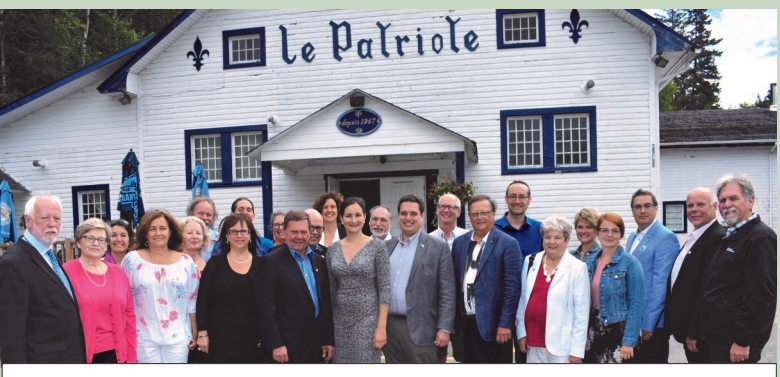
Théâtre Le Patriote; Sainte-Agathe-des-Monts Canada-Québec Small Communities Fund