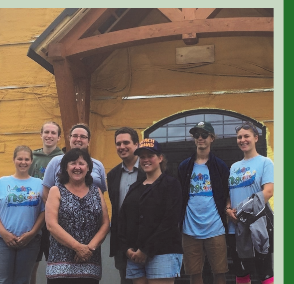
Sainte-Anne-des-Lacs Community Centre Upgrades CIP 150 — August 2017