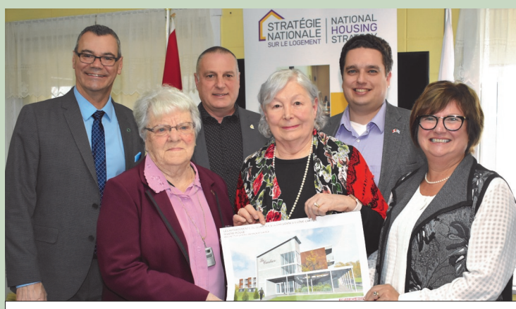
Villa-Cartier Project; Rivière-Rouge Social Housing Construction SHO and CMHC — March 2019