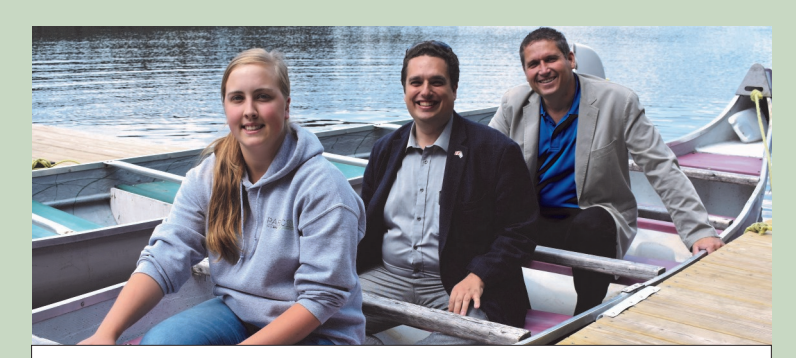
Saint-Faustin-Lac-Carré Parc Éco Tourisme Laurentides (CTEL) Facility Improvements; CIP 150 — August 2017