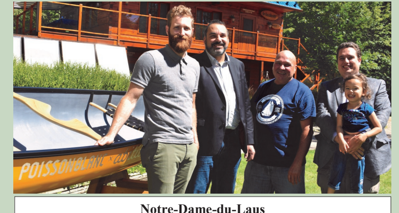
Notre-Dame-du-Laus Poisson Blanc Regional Park Facility Improvements; CIP 150 — August 2017