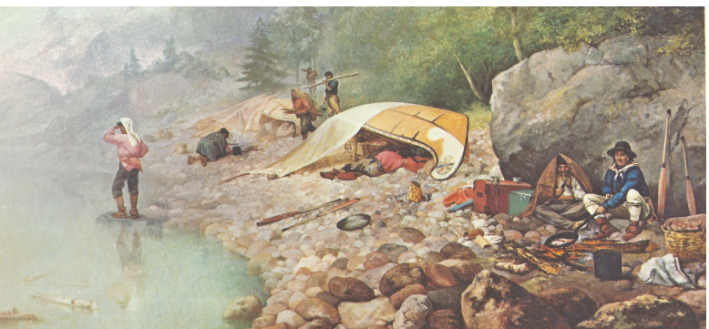
Voyageurs at Dawn 1871 Frances Anne Hopkins

Name : _____ Address : _____ Municipality : _____ Postal code : _____ Telephone : _____ E-mail : _____